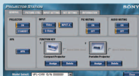
Projector Station version 3.0

* PROJECTOR STATION version 3.0 software requirements: Microsoft® Windows® 98, Windows® 98 SE, Windows Me or Windows® 2000 operating system.