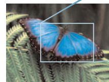
4-times Digital Zoom